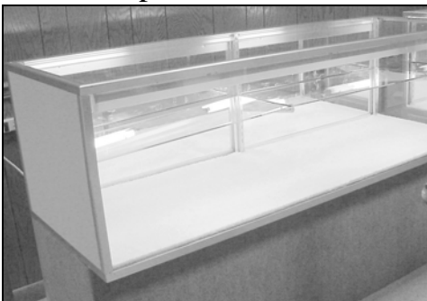
Lighted display cases in which to display the trophies are now available.

Bobby Seater has spent countless hours obtaining and refurbishing attractive, lighted display cases in which to display the school trophies and has done an outstanding