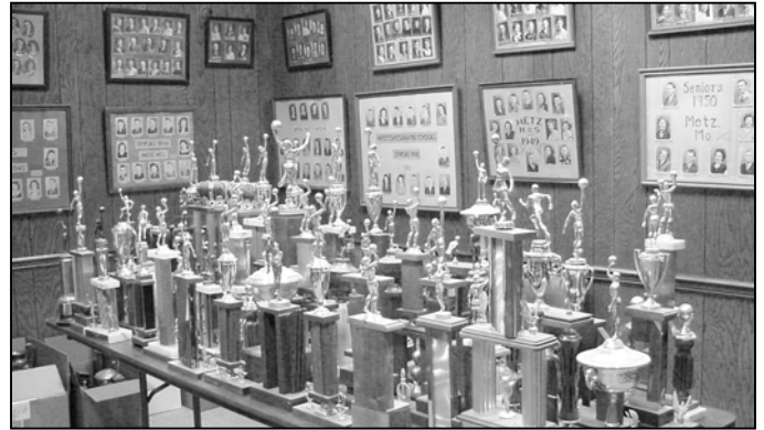
Metz School trophies and graduating class pictures were moved to the Metz Bank in Metz.

display at the Metz Bank, please bring them to the Alumni dinner, take them directly to the bank and ask the bank manager to place them in the trophy room, or give them to