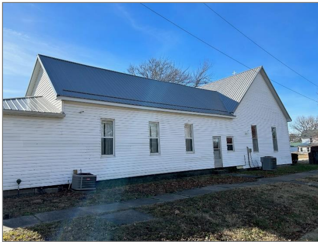
Prairie Divide School building added to the east side of the Bronaugh Christian Church to serve as classrooms and dining hall—the center section in this picture.