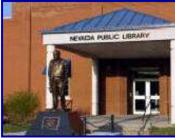
Nevada Library and Bushwhacker Museum

Tri-County Genealogical Society (Vernon-Cedar-St. Clair Counties) c/o Nevada Public Library 218 West Walnut Street Nevada, MO 64772 tricountygenealogy@centurytel.net http://www.rootsweb.com/~motcogs/