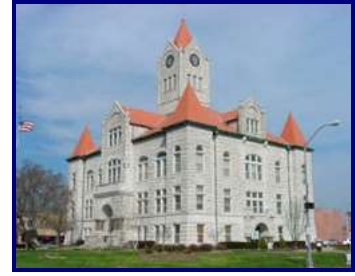
Vernon County Courthouse Nevada, Missouri

Tri-County Genealogical Society (Vernon-Cedar-St. Clair Counties) c/o Nevada Public Library 218 West Walnut Street Nevada, MO 64772 tricountygenealogy@centurytel.net http://www.rootsweb.com/~motcogs/